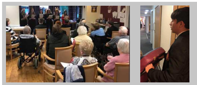
Advent Mass at Peacock Nursing Home Thanks to our Senior Choir and S3 pupils for their help

This coming Sunday, on the 2nd Sunday of Advent, John the Baptist makes his appearance with his message of "CHANGE!" Faith is not something that can be imposed on us or done to us, we have to actively engage with God's Love for ourselves. How can we respond to John the Baptist's call this Advent?